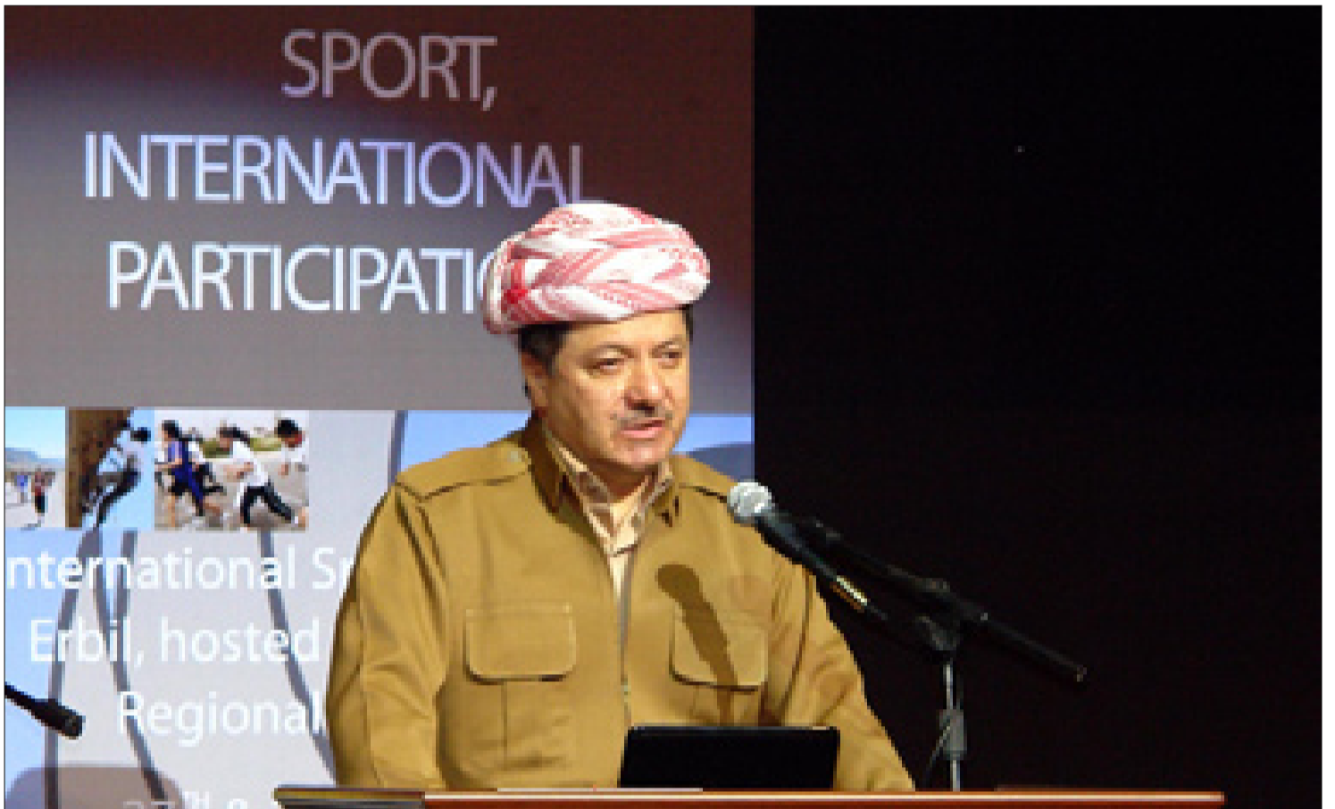
Kurdistan Region President Massoud Barzani addresses the first International Sport Conference held in Erbil, April 27.